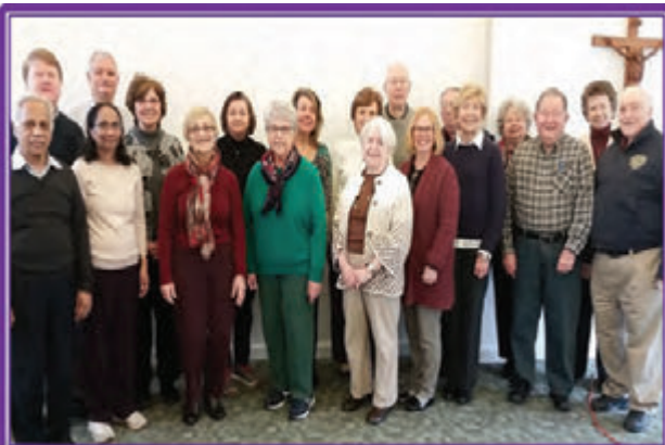
Parishioners attending Bishop Robert Barron's "Pivotal Players". This is a study of saints, scholars, artists, and mystics who shaped the life of the Catholic Church.

Virtual Online and Self-paced Online Courses Register at: www.ccli.org or Couple to Couple League- 800-745-8252.