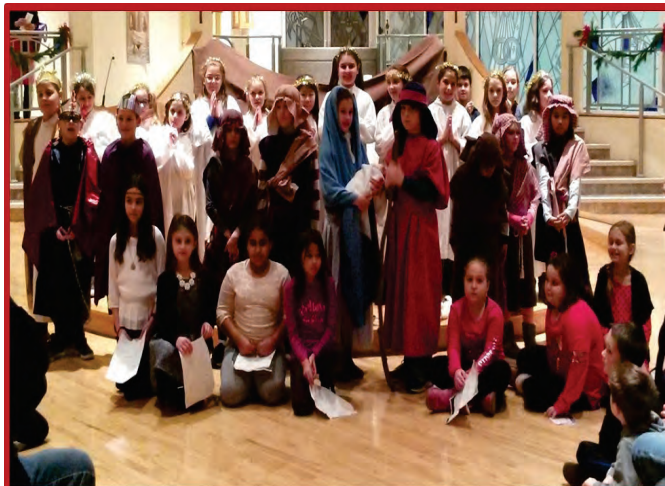
Religious Education Students participate in Christmas Pageant and Prayer Service last month.