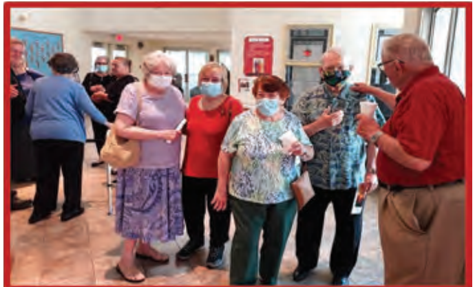
Parishioners gather for lite refreshments after the Mass of the Anointing of the Sick.