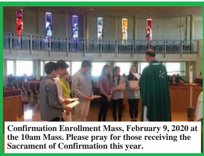
Confirmation Enrollment Mass, February 9, 2020 at the 10am Mass. Please pray for those receiving the Sacrament of Confirmation this year.