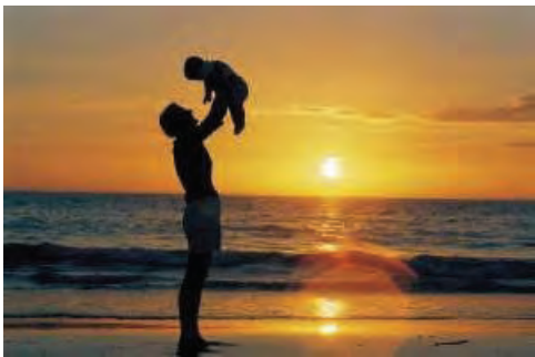
Happy Father's Day!