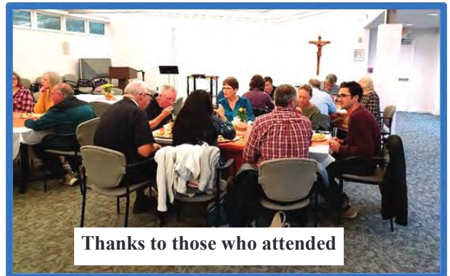
Thanks to those who attended